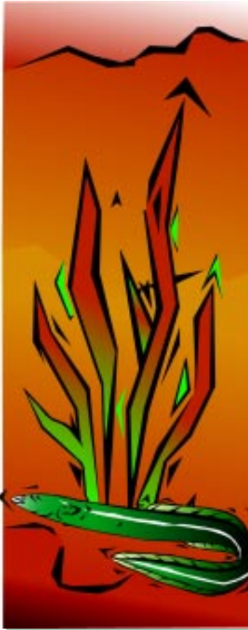
American Eel Anguilla rostrata